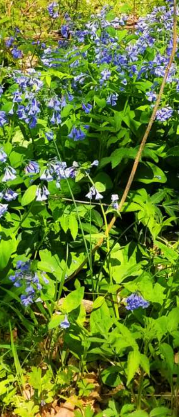
Photo: Bluebells thrive in a Daviess County forest, late Spring 2023

Our mission: Meet the changing needs of Daviess County by fostering a culture of local philanthropy.